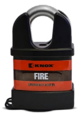
EXTERIOR USE Model #3784