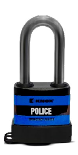
EXTERIOR USE Model #3782