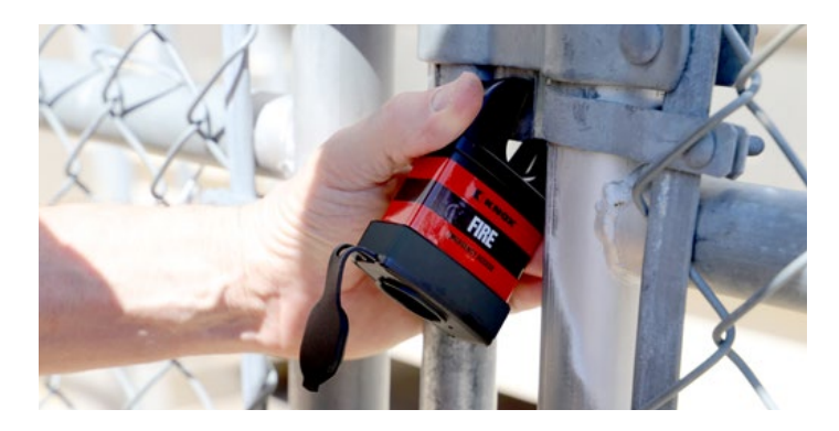
The 3784 offers the highest security. Protected shackle, greatly reduces shackle attack, deters unauthorized entry.